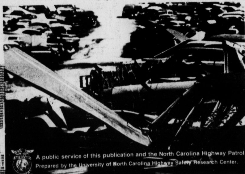
A public service of this publication and the North Carolina Highway Patrol. Prepared by the University of North Carolina Highway Safety Research Center.

Slowing down to save fuel resulted in the ultimate savings — that of lives. But the North Carolina Highway Patrol reminds us that slowing down is not a matter of choice. 55 mph is the law. It is enforced.