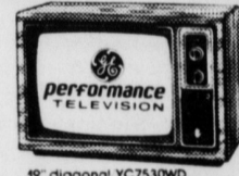
19" diagonal YC7530WD Walnut finish on high impact plastic