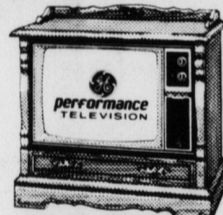
25" diagonal YM942AP EASY AMERICAN STYLING distressed antique pine finish on hardwood solids and wood composition board. Concealed Casters

Automatic Fine Tuning Automatic Color Control 100 Percent Solid State Energy Saving Chassis