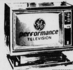
WM9307WD Cabinet constructed of simulated walnut grained vinyl on wood composition board. Stand constructed of black and wood grained vinyl on wood composition board.

100 Percent Solid State Automatic Fine Tuning Automatic Color Control Energy Saving Chassis