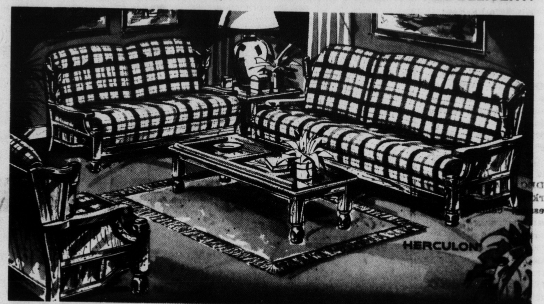
"COUNTRY CASUAL" LEISURE LIVING ROOM IN A BEAUTIFUL PLAID HERCULON® COVER

SAVE ON FURNISHINGS FOR THE FAMILY AND HOME DURING THIS GREAT HOLIDAY SALE! SPECIAL SAVINGS! SUPERB QUALITY! FREE DELIVERY!