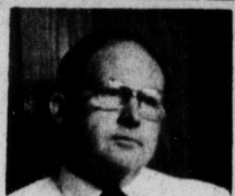
From Wilson Griffin

Salt addicts are more prone to high blood pressure, report doctors with the National Heart and Lung Institute. They found that people with hypertension have a history of consuming four times as much salt as persons with normal blood pressure. High salt consumption and fluid retention have been associated with high blood pressure for years.