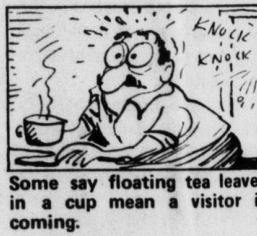
Some say floating tea leaves in a cup mean a visitor is coming.