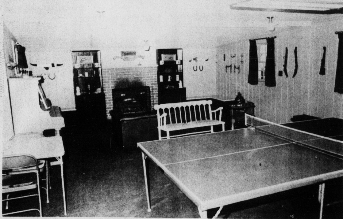
BUNKHOUSE — The family recreation room or "bunkhouse" of the Dean Westmoreland home is decorated for comfort. The wall decor features tools used on the Westmoreland farm.