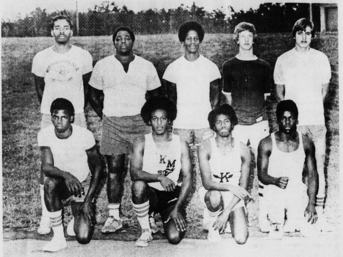
IN REGIONALS — These Kings Mountain High Undermen will be competing in the Western Regionals Friday at Freedom High School in Morganton. Front row, left to right, is the 880 relay team, which includes