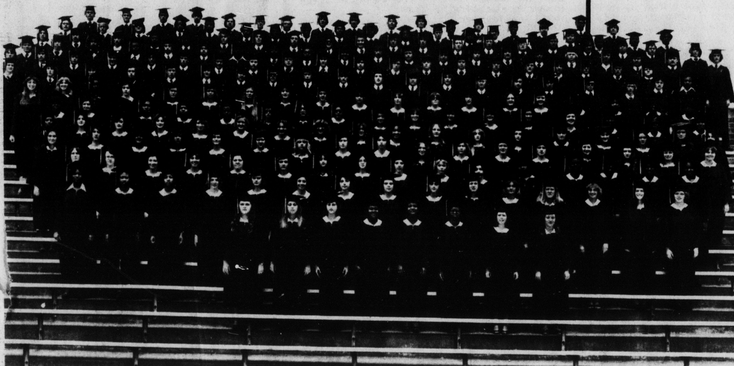
KMSHS GRADUATING CLASS OF 1978 — Pictured are members of the Kings Mountain Senior High graduating class who will receive diplomas in finals exercises Thursday (tonight) at 8 p. m. in B. N. Barnes Auditorium. Members of the Senior Class will lead the