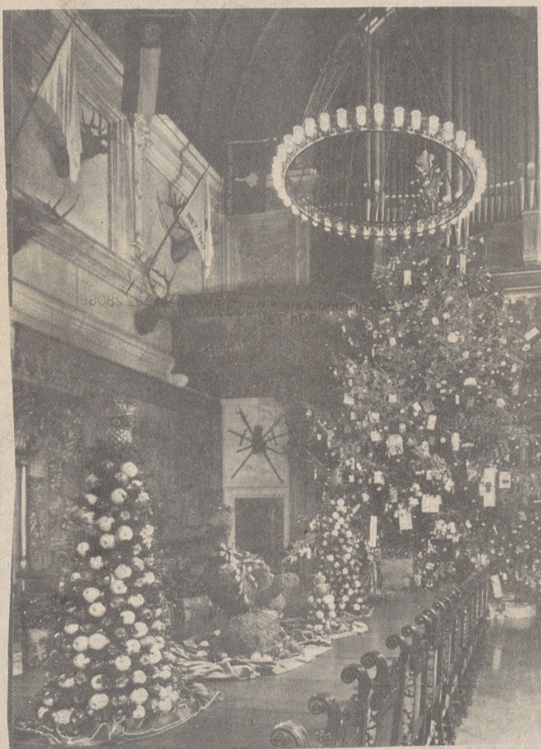
Topiary, the art of trimming or training trees and shrubs into ornamental shapes was a Victorian favorite. It is also a favorite at Biltmore House where topiary animals and a 40-foot Frazier Fir grace the Banquet Hall.