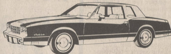
Monte Carlo Sport Coupe