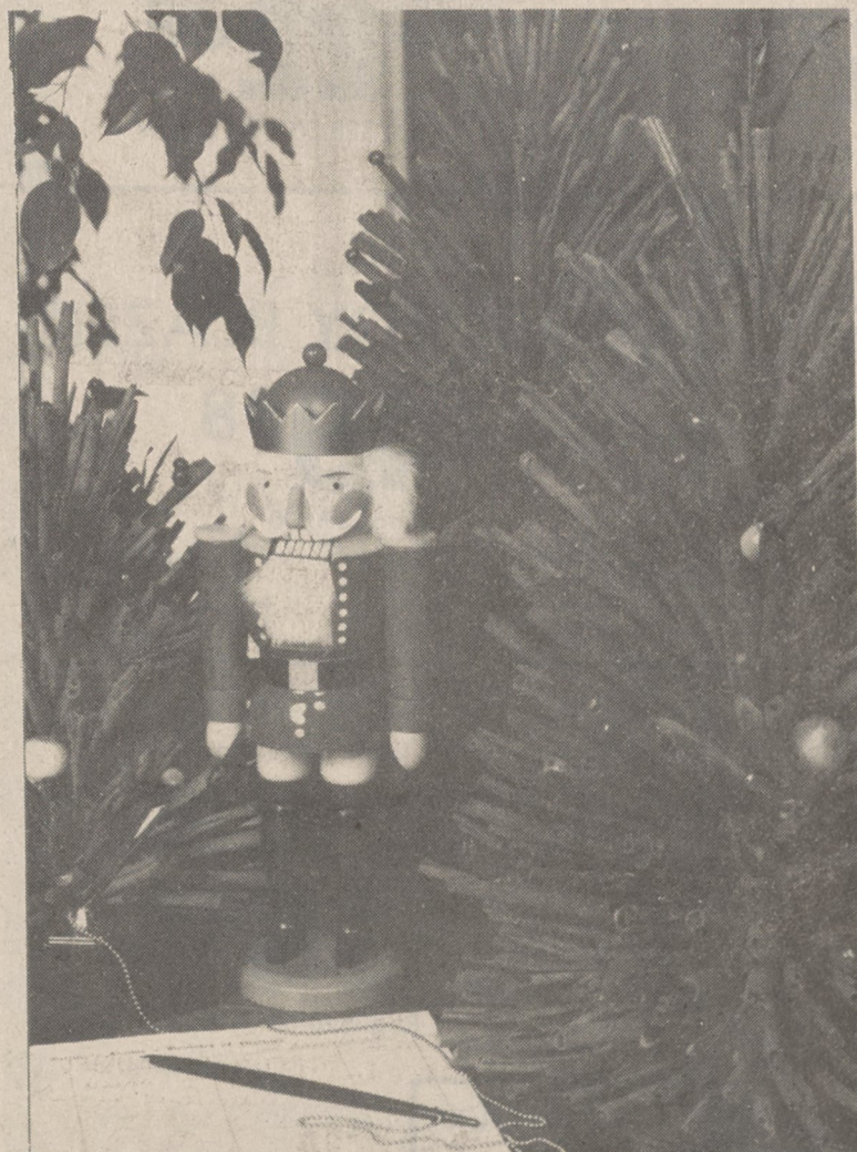
During the month of December, Victorian Christmas traditions come alive at Biltmore House. This cinnamon stick tree is one of many scattered throughout the 250-room French Renaissance chateau. The trees are misted regularly during the holidays, filling the house with the spicy aroma of Christmas.