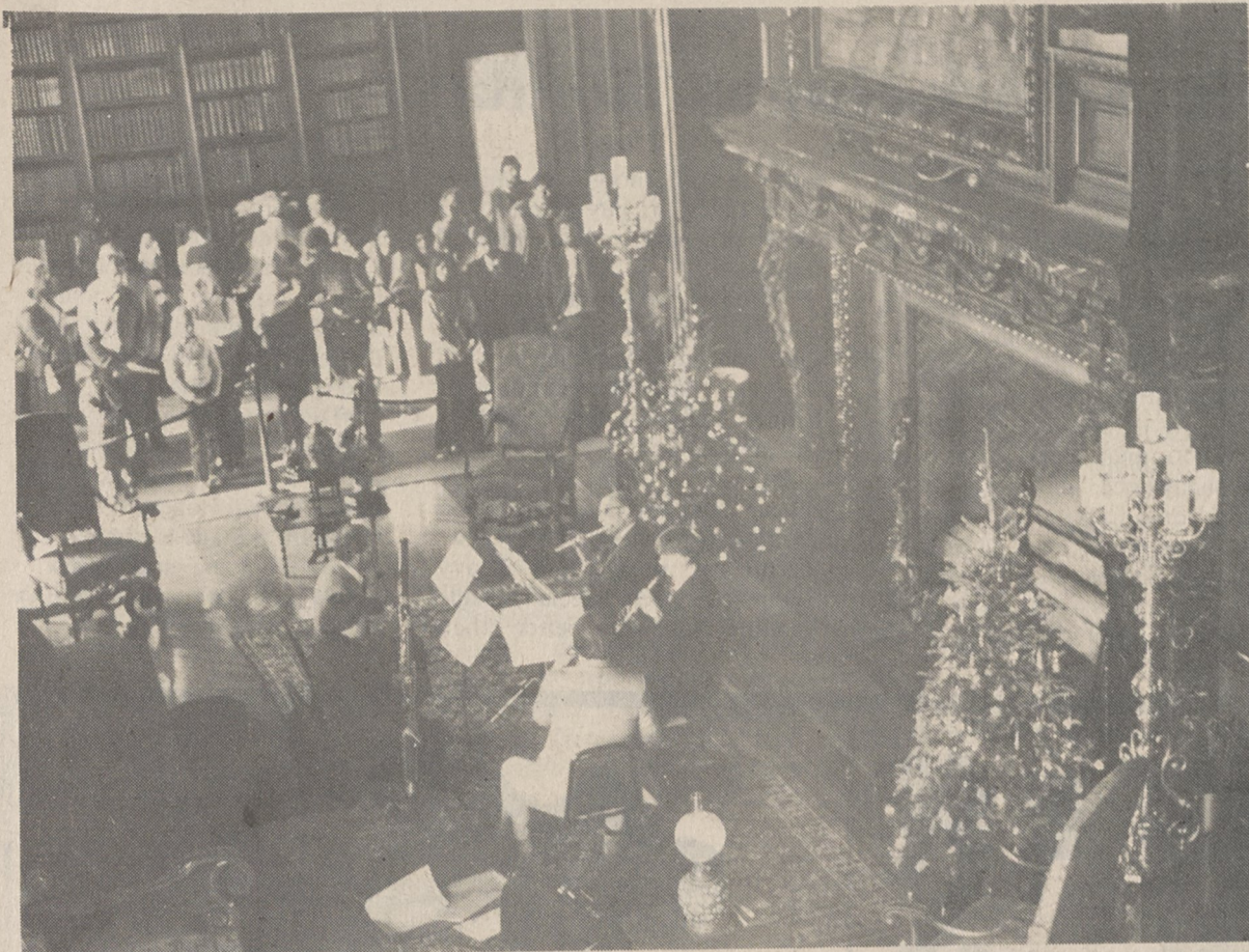
Beginning on December 3 and continuing through the month, Biltmore House will host concerts by area choral and instrumental ensembles. These groups, which include the