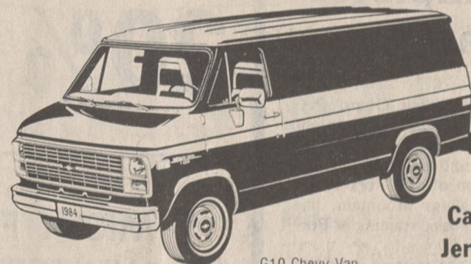
G10 Chevy Van

Maybe Kiser's Is Not The Largest Dealer In The Area, But Certainly The Cheapest