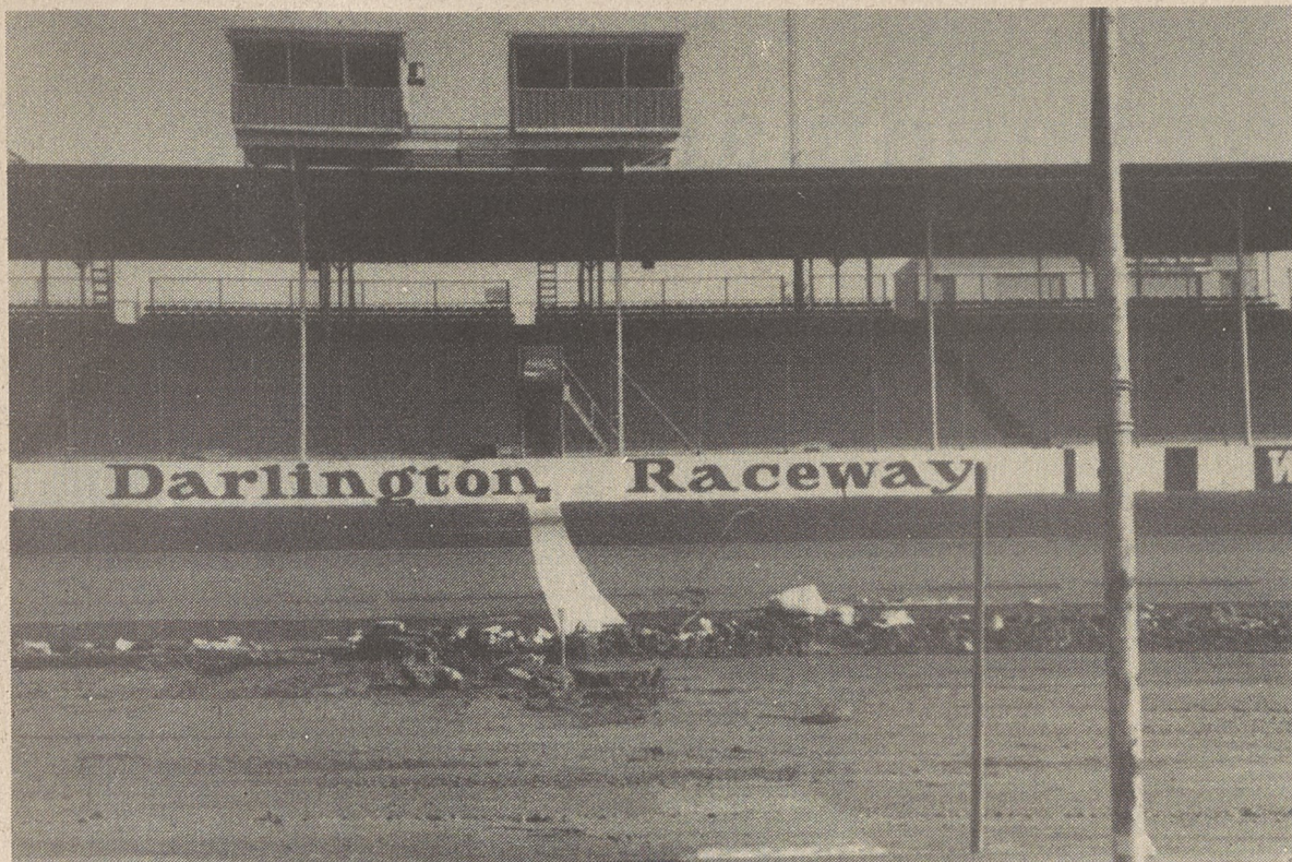
WALL-LESS TRACK —The old wall that protected the Darlington Raceway Pit area is gone. It has been replaced with a new concrete barrier, four feet high, a foot wide and 1,764 feet long. All of the new construction will be completed prior to the Dixie Cup 200, Saturday, April 13 and the Transouth 500, Sunday, April 14.