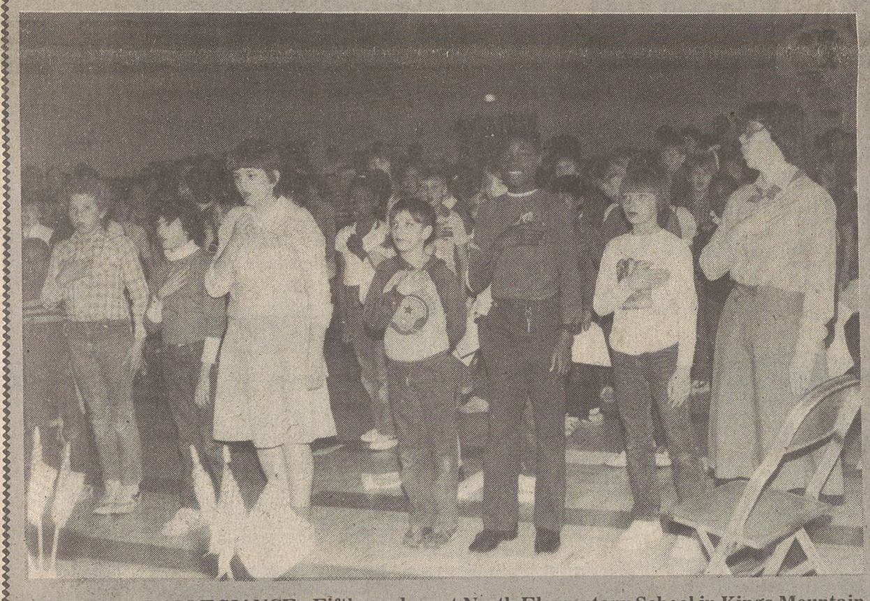
PLEDGE OF ALLEGIANCE - Fifth graders at North Elementary School in Kings Mountain say the Pledge of Allegiance to the U.S. flag to open their Red, White and Blue Day activities in the school auditorium.