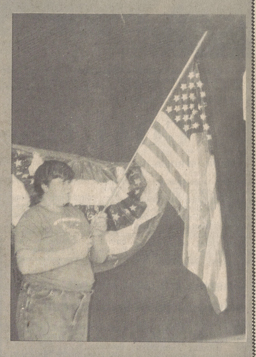
PLEDGE TO FLAG - A Pledge of Allegiance to the American flag got Red, White and Blue Day festivities under-