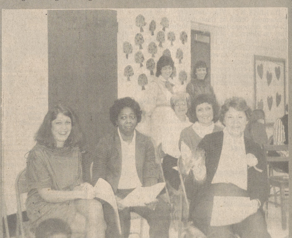
TEACHERS JOIN FUN - Teachers at East Elementary School joined in the singing of patriotic songs during the school's Red, White and Blue Day activities.