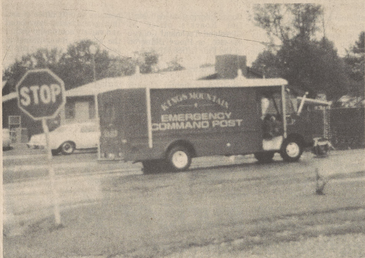
ON DUTY IN STORM - Kings Mountain's Emergency Command Post was on the scene on Bridges Drive during Saturday's seven-inch rainfall which caused a rash of water problems for residents in Kings Mountain and surrounding areas.