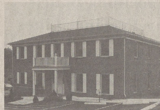
Kanawha Insurance Company's new office in the Garrison Professional Park at 1343-B East Garrison Boulevard in Gastonia.