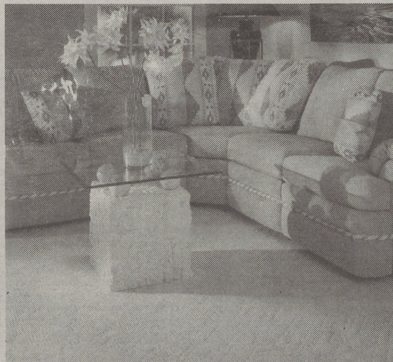
Textured carpet from Peerless/Galaxy provides a unique backdrop for this neutral colored room. A variety of materials, textures and surfaces were used for a creative, calming room decor.