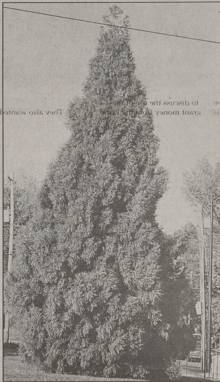
The tree in front of Mauney Memorial Library will be decorated with Christmas lights and yellow ribbons, in honor of the 505th battalion, which has just been stationed in Washington, D.C. The tree-lighting will take place on Monday, November 25, at 7 p.m.

The tree lighting will be part of the "Down Home Christmas" celebration, which will also include a mural lighting and a Christmas parade in early December. More information will be available on these events later.