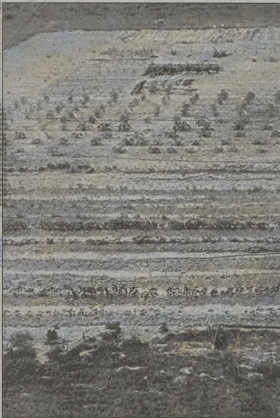
The employees' garden at Kings Mountain Technology Center is taking shape this week.

The 72 employees of Kings Mountain Technology Center are planting a garden for the second year and giving it to the needy.