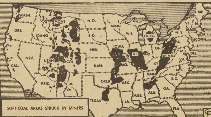
BITUMINOUS COAL REGIONS where more than 400,000 United Mine Workers (AFL) and other unions will be idle are indicated on map (bottom) by black sections. John L. Lewis (top), president of the United Mine Workers, gives the "out" sign, familiar to baseball fans. And "out" they went, with Lewis declaring that there would be no picketing and a slow-up in steel production.