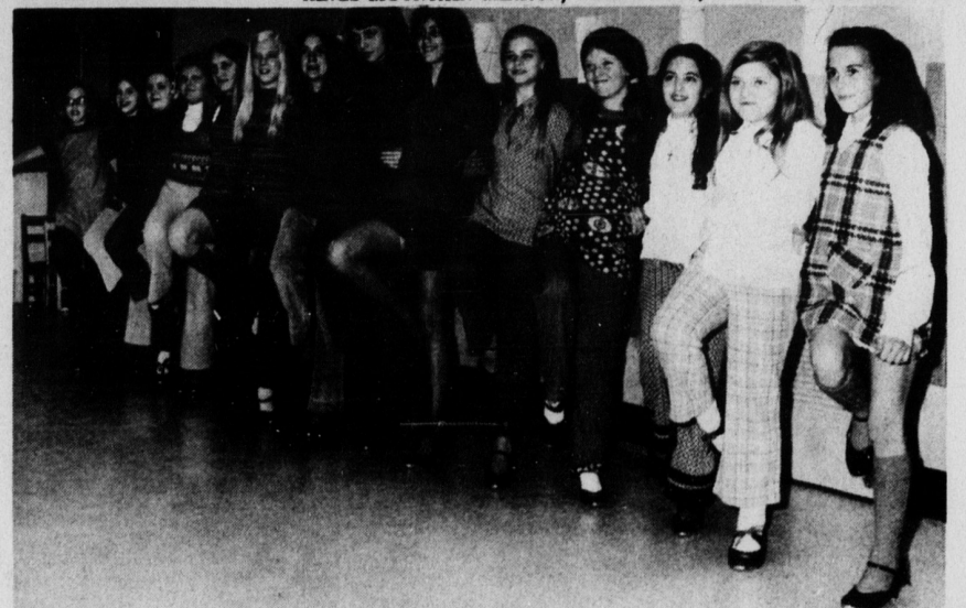
Some of the 120 students at the Jane McClure School of Dance at the Community Center.

He is a good man whom fortune makes better. -Thomas Fuller.