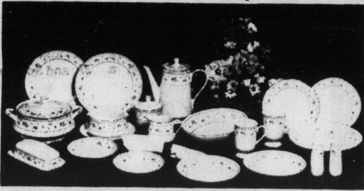
Matching accessories to complete your collection include:

Matching accessory pieces are also available to complete your collection. Each accessory is available throughout the entire program with no purchase requirement!