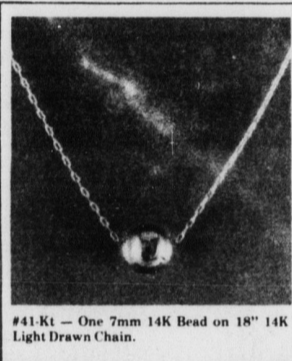
#41-K1 - One 7mm 14K Bead on 18" 14K Light Drawn Chain.

The Kings Mountain Mirror-Herald is published each Tuesday and Thursday by General Publishing Company, P. O. Drawer 782, Kings Mountain, N. C., 28086. Business and editorial offices are located at 204 South Piedmont Ave. Single copy 15 cents. Subscription rates: $8.50 yearly in-state, $4.25 six months; $9.50 yearly out-of-state, $5 six months; Student rate for nine months $6.24. Second Class postage paid at Kings Mountain, N. C.