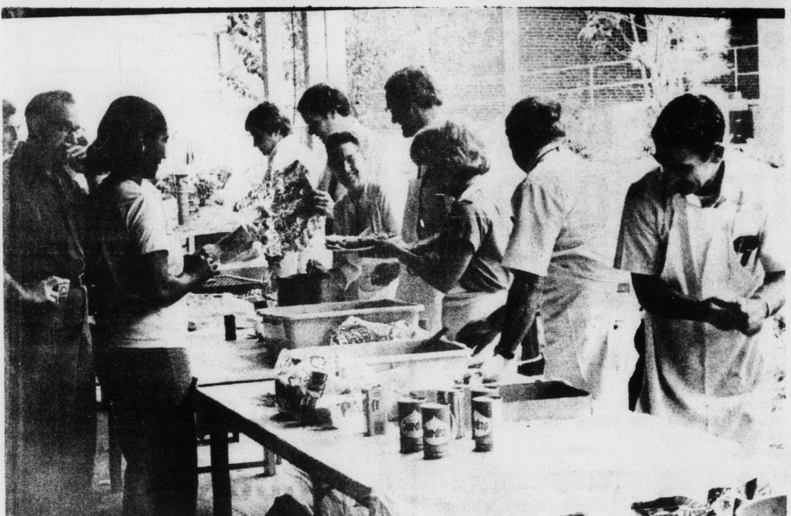
GOOD FOOD AND FELLOWSHIP —Phenix Plant "bosses" entertained the employees last Wednesday at the annual Appreciation Day festivities. Hamburgers and hotdogs with all the trimmings were served on all