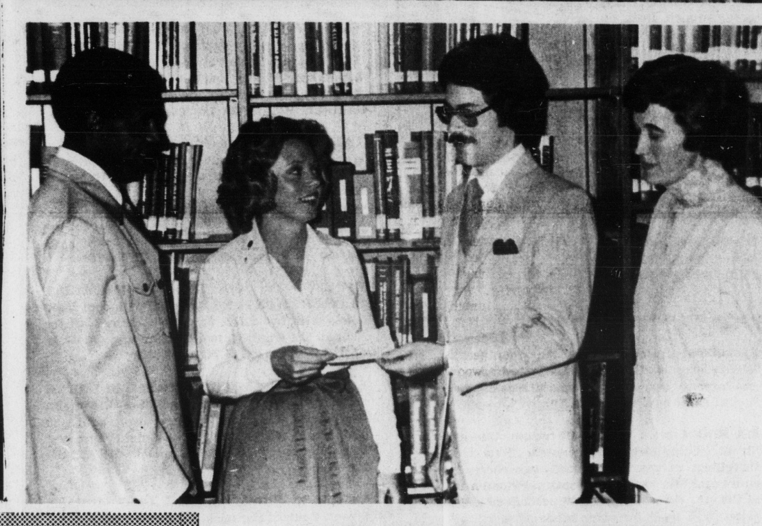
FIRST GAMMA BETA PHI SCHOLARSHIP AWARDED - Cleveland Tech's chapter of the Gamma