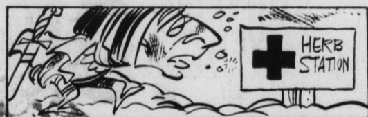
The old herb doctors used parsley to give renewed health and strength to warriors wounded in battle.