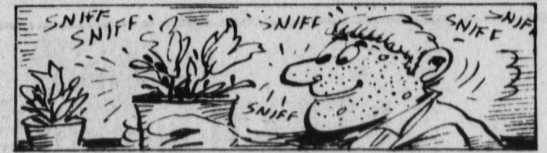
Smelling lilies is believed to give a person freckles.

The odds are one in thirteen that a person age 25 and over will have lost some degree of sight.