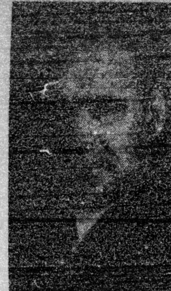
DR. MORDECAI W. JOHNSON President, Howard University