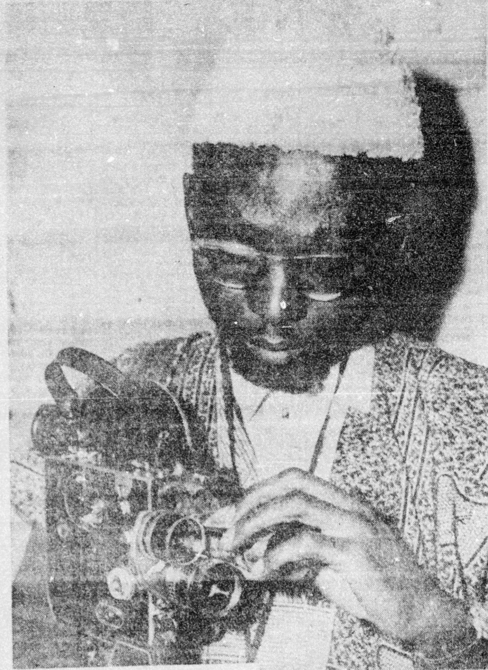
FOCUS ON CHANGE — His picturesque clothes may be rooted in tradition, but the outlook of this African is strictly modern as he examines a movie camera in Rome. He is a delegate to the Second Congress of Negro Writers and Artists, attended by representatives from the Americas as well as Africa. They discussed "The Unity and Responsibility of African Negro Culture."