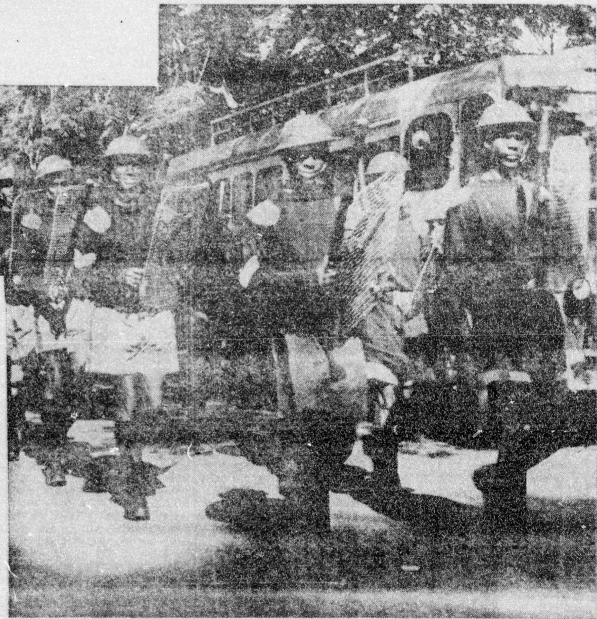
GO ON PATROL — Members of a riot squad of the African security police move off on patrol here carrying clubs and mesh screens to protect them from thrown objects. An uneasy quiet prevailed in Nyasaland March 27th after three weeks of rioting by supporters of African Nationalism and arrested extremist leader Dr. Hastings Banda. (UPI PHOTO).