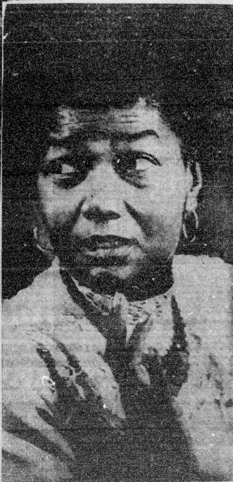
OWNS HOME IN APPLE VALLEY, CALIF. — Although she seldom stays in one place very long because of numerous stage, screen, radio, night club, TV and recording commitments, Pearl Bailey (above) has a home here in Apple Valley to which she returns as often as possible. While co-starring as Maria in Samuel Goldwyn's motion picture production of "Porgy and Bess," Miss Bailey made the round trip to and from Apple Valley every weekend, and entertained about half the cast there, too. She and her husband have about 35 acres there.