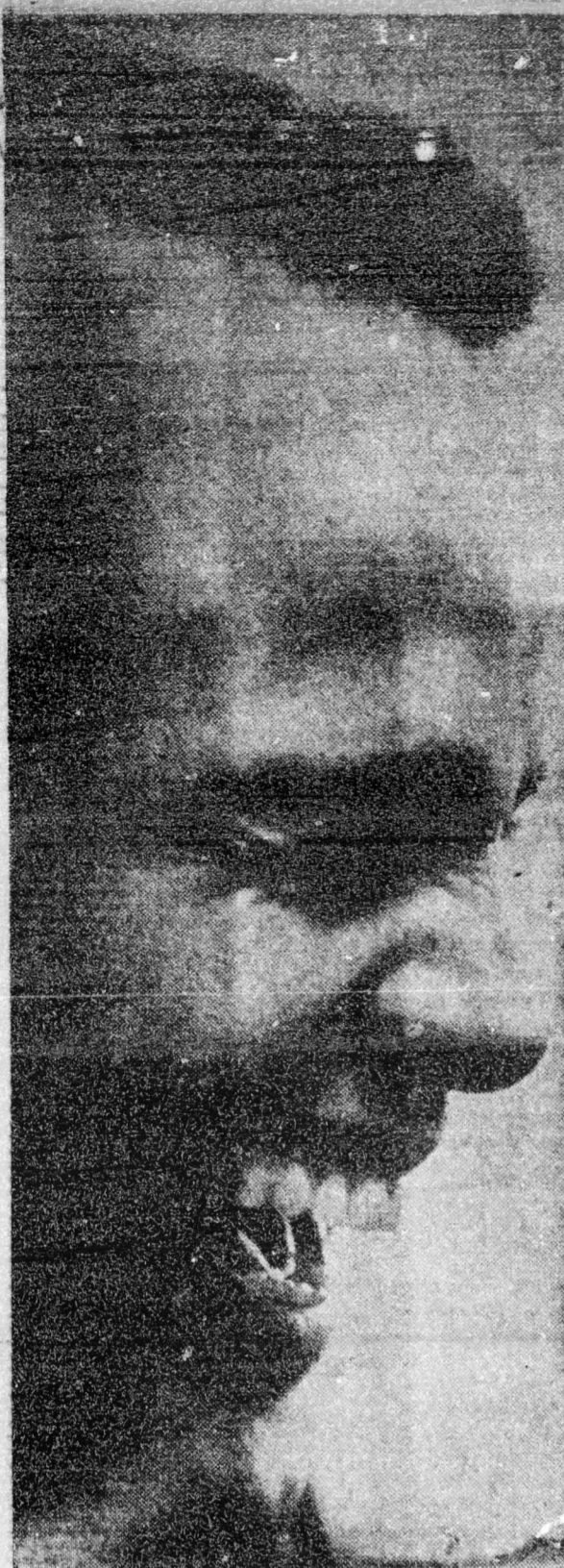
ATTENDS "SOME LIKE IT HOT" PREMIERE — Singer Harry Belafonte enjoys a laugh at New York's New Loew's State Theatre March 28th, where he was attending the New York premiere of the film, "Some Like It Hot.".