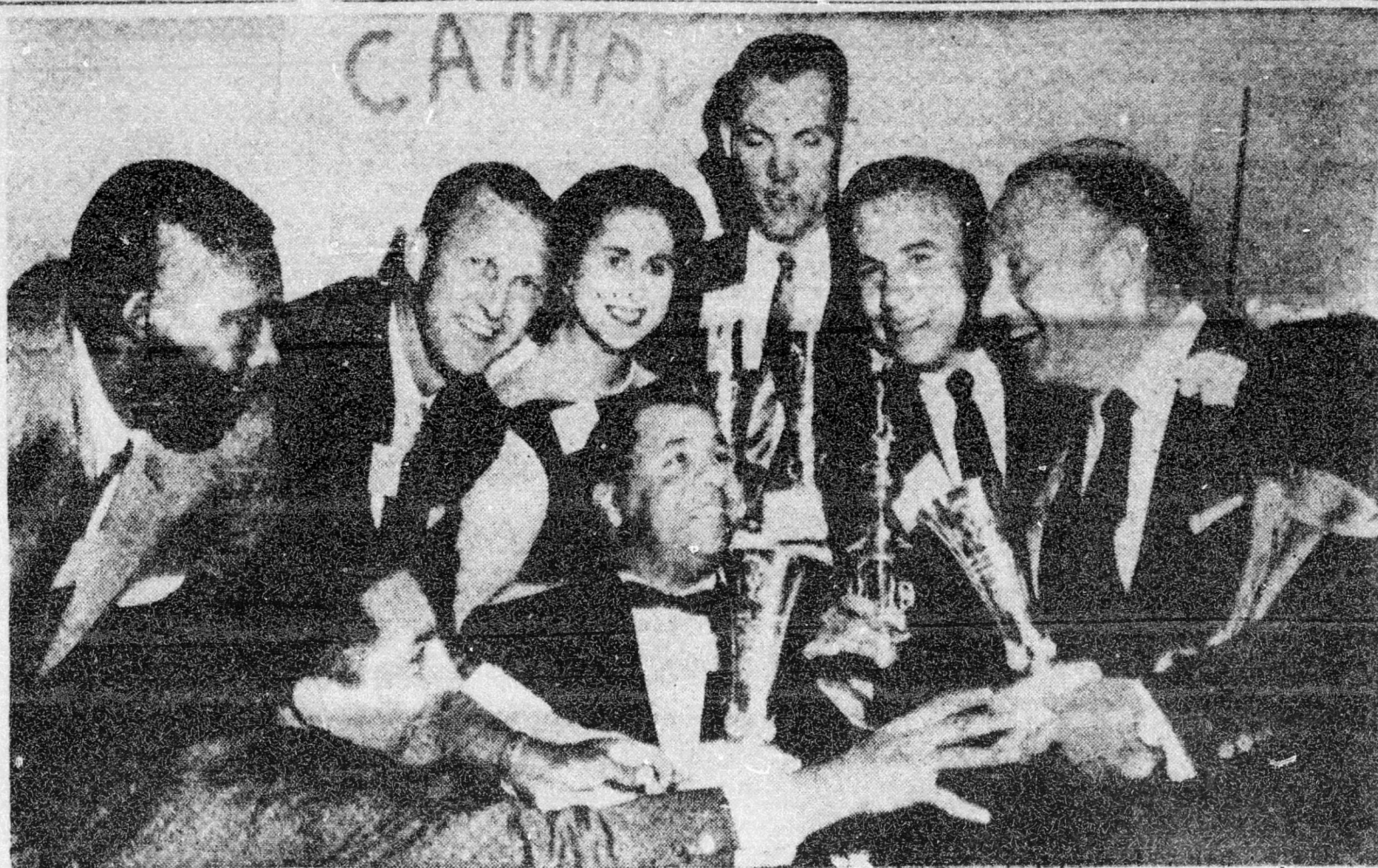
THEY'RE ALL HIS FRIENDS — Seated in his wheelchair, former Dodger catcher Roy Campanella, center, is flanked by Dodger players and others during the 2nd Annual Baseball Writers Association Dodger Dinner at Los Angeles last Monday night. Campy received the warm greeting and an ovation when he was presented