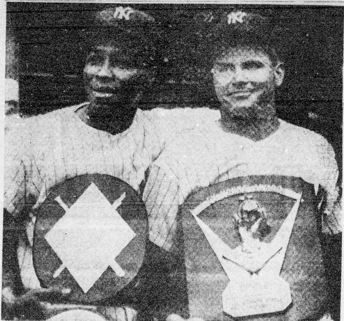
NO USE TRYING — Catcher Elston Howard, left, with his Babe Ruth Award, and Pitcher Bob Turley, with his Cy Young Award, are seen at Yankee Stadium recently, all dressed up for a rained-out game against the Boston Red Sox. The Yankees' previous attempt at an opening game with the Bosos was rained out on April 10. Sometimes it's just no use even trying.

Robinson claims the commission has no authority to take his title and charges the body is discriminating against him by forcing the issue. First, Ray claims there is no precedent under which the commission can enforce the six-month ruling. Secondly, he points to other instances where similar action was not taken.