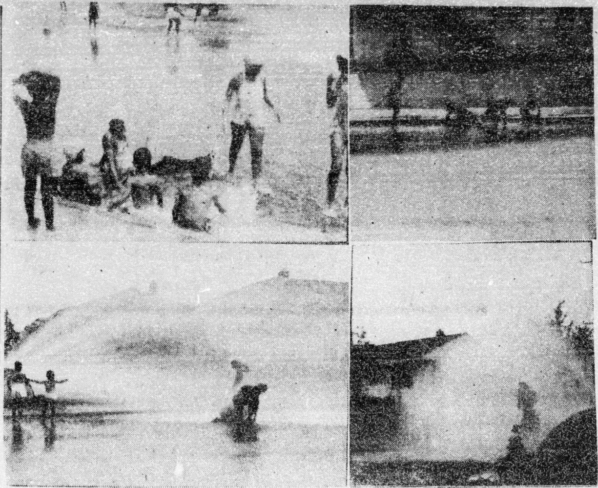
WASHINGTON TERRACE KIDS IN ACTION