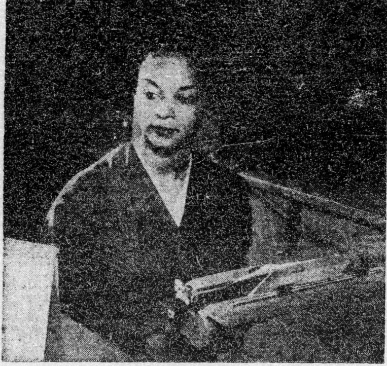
YOUNG CAREER WOMAN

Today, doors are still being slammed on job-seekers, but the "why" of it differs. Today those in the executive suites are asking questions like this: "Have you had formal business training?" "Have you a certificate from an accredited business school?" "Can you operate