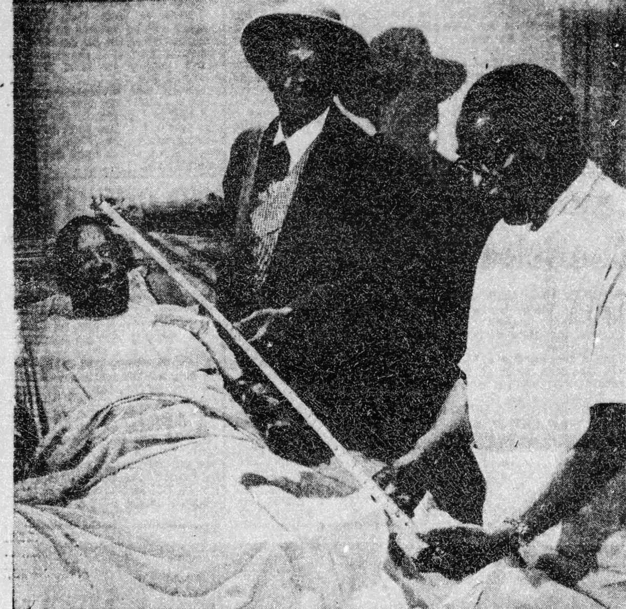
NOT THAT EVERYTHING WON'T TURN OUT RIGHT BUT... When the ministering doctor also feels it is a smart precautionary move to measure the patient, Andy (Spencer Williams) loses his sense of security in "AMOS 'N' ANDY" seen on Station WRAL, weekdays at 1:15 p.m. and Tuesdays at 8:00 p.m. The sympathetic gentleman at the head of the bed is George "Kingfish" Stevens (Tim Moore). The series is distributed by CBS Television Film Sales, Inc.

With the current "Bostnik" fad evident in many of the skits, the situations ranged from an incident in the Greenwich Village Elementary School, through a trial in the old west to a Dogpatch wedding with all of the trimmings. The organizations participating were the Student National Educational Association, the Alpha Kappa Alpha Sorority, the Hampton Band, the Olympic Social Club, the Dance Group, the Omega Psi Phi Fraternity, and the Alpha Phi Alpha Fraternity.