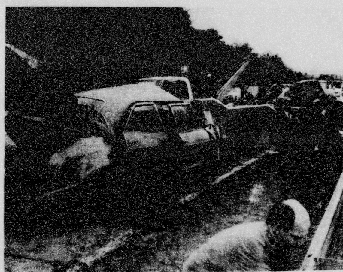
HEAD-ON COLLISION KILLS SIX - Beaver Falls, Pa.: Four men and two women were killed August 4 in this head-on collision two-miles east of the Beaver Valley Interchange of the 29-year-old Pennsylvania Turnpike. Work crews are shown below clearing the wreckage.