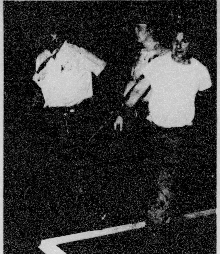
HECKLER GOES TO JAIL - Passaic, N. J.: Policemen rush a heckler to a waiting police van here late August 5 after a small number of Puerto Rican and black youths remained in the street in defiance of a 9 p.m. general curfew in effect for the first time. But police reported the situation was "under control" in this city of 38,000 where gangs threw fire bombs, looted stores and smashed windows August 3 and August 4.