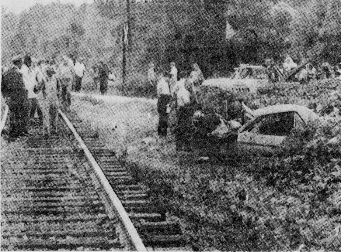
DEATH STRIKES ON RAILROAD TRACKS - Austell, Ga.: Labor Day weekend fatalities rose as a Southern Railway train clattered down these tracks and struck this car when it failed to see the train approaching. Dragging the car's engine with it, the locomotive finally came to a stop several thousand feet down the track. Two persons were killed and two others remain in serious condition.