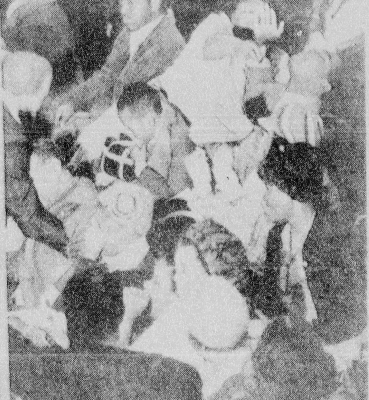
RICHARD M. NIXON