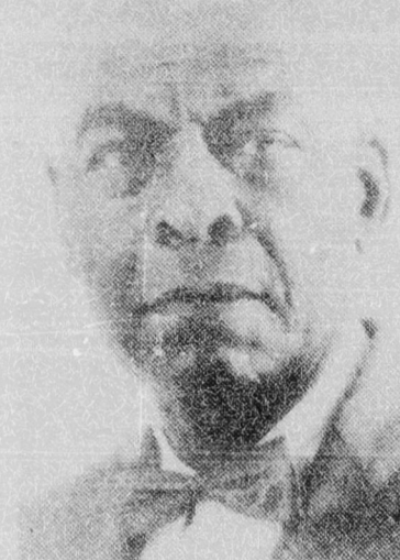
DR. BENJAMIN E. MAYS