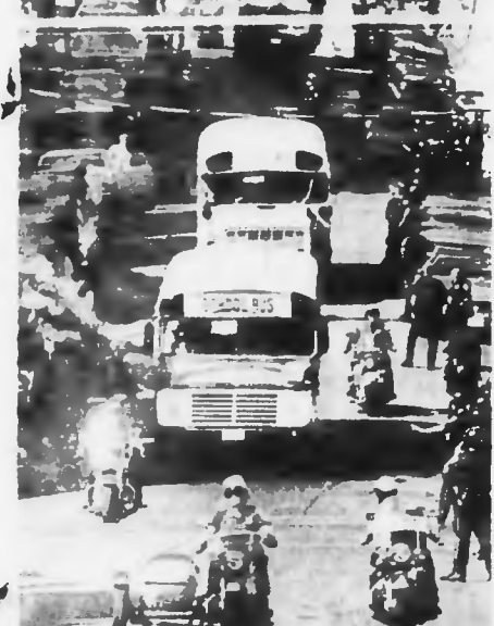
BUSING IN BOSTON - Boston - The third day of integrated public school over in Boston, Sept. 6, black students are bused back to Roxbury from South Boston under a heavy guard of police escorts. Roving gangs of South Boston have tried to disrupt the court ordered busing.