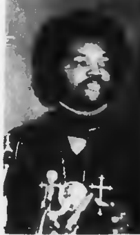
REV. JESSE L. JACKSON