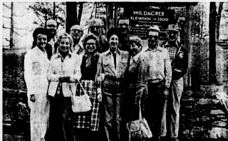
Yiddish Institute Wildacres, May 1979 Planning Committee