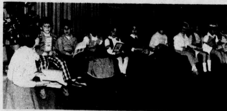
Story telling time at the Seder.