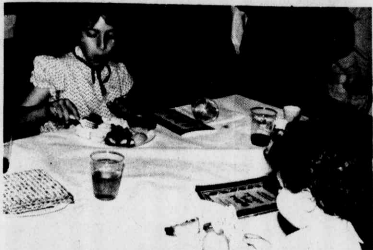
Children enjoying the Academy Seder.