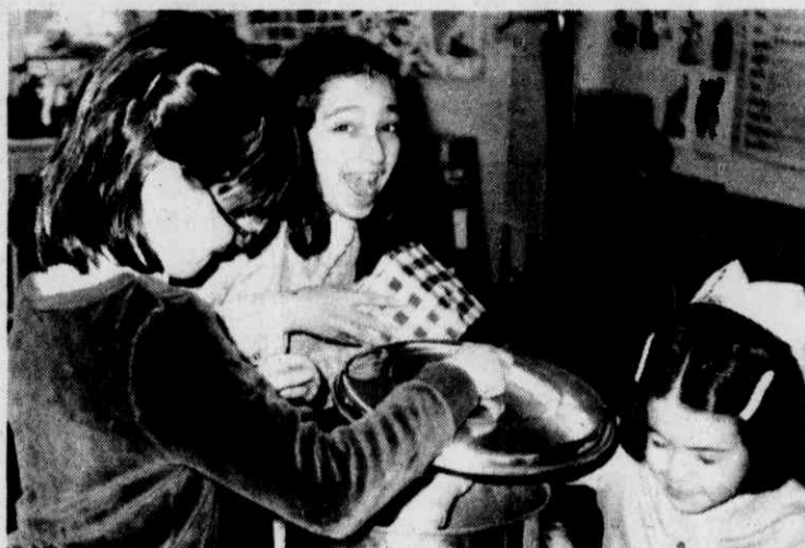
Having fun at the Academy Purim Carnival.

Everyone partook of a light meal which consisted of some traditional Pesach foods highlighted by charoset made at the Academy by the kindergarten and first graders. Several girls from Chai BBG were there to assist and serve as part of their commitment to community service.