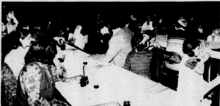
Academy children and their families enjoying the Seder.