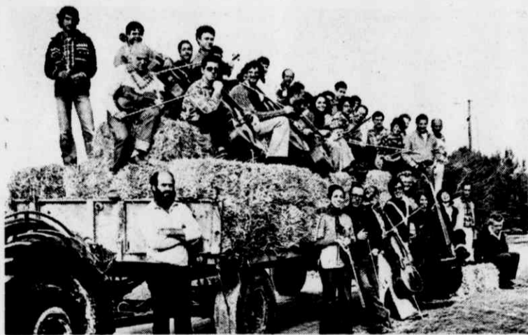
Kibbutz Chamber Orchestra of Israel.

The Royal Winnipeg Ballet, the oldest ballet company in Canada. The 26 member group has performed all over the