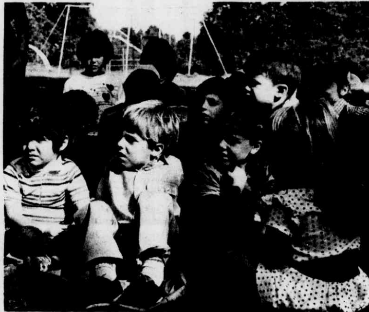
Temple Israel nursery children.