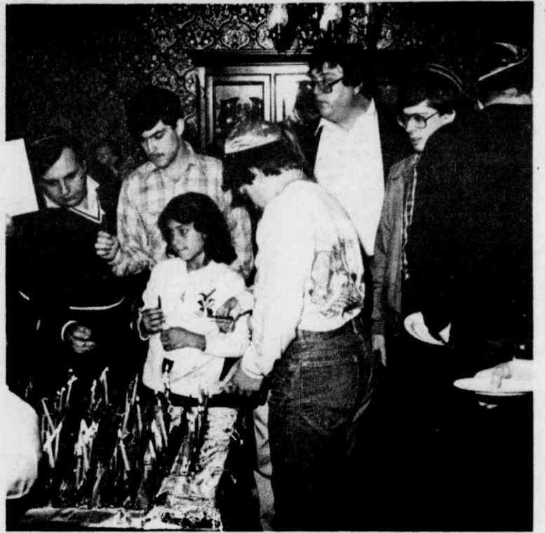
On Tuesday, December 6, the seventh night of Chanukah, a group of sixty people experienced a Chanukah celebration at the Lubavitch residence.