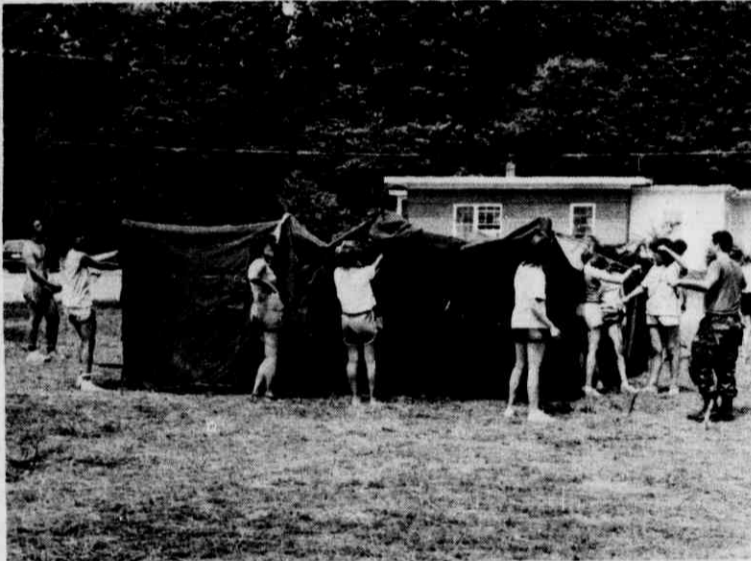
Camp Staff putting up tents for the campers.