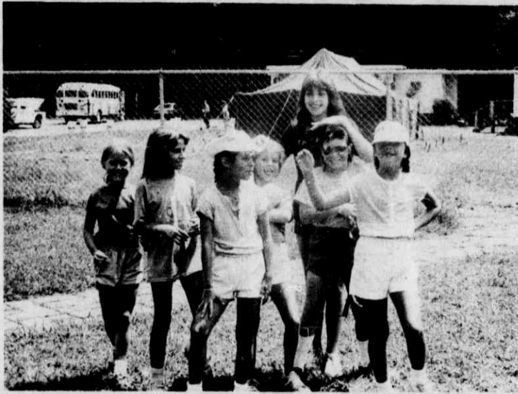
Campers clowning around for the camera.