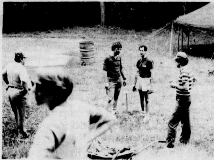
JCC Board Members join the Staff in erecting the tents.