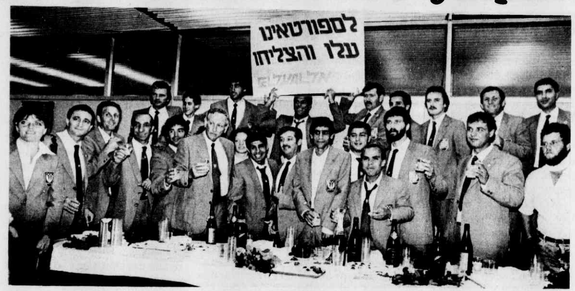
Israel's delegation to the 1984 Olympics departed from Tel Aviv's Ben Gurion Airport on board El Al's direct flight to Los Angeles. Before their departure, the sportsmen were greeted by a throng of well-wishers, including El Al employees, who toasted Israel's Olympic Team with champagne.