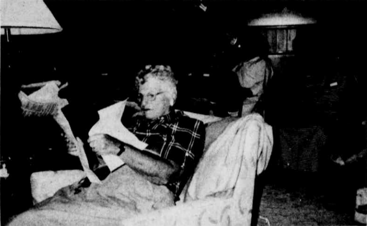
More of the group perusing Campaign flyers.

political action, Soviet Jewry, civil rights, church and state, etc. are being planned.