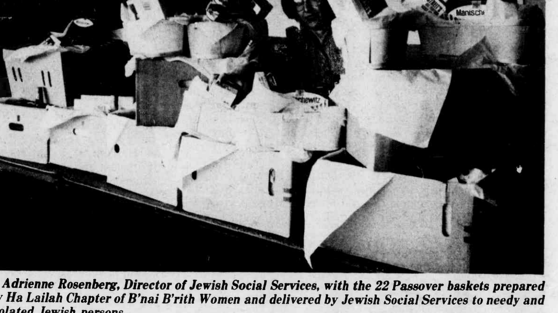
by Ha Lailah Chapter of B'nai B'rith Women and delivered by Jewish Social Services to needy and isolated Jewish persons.