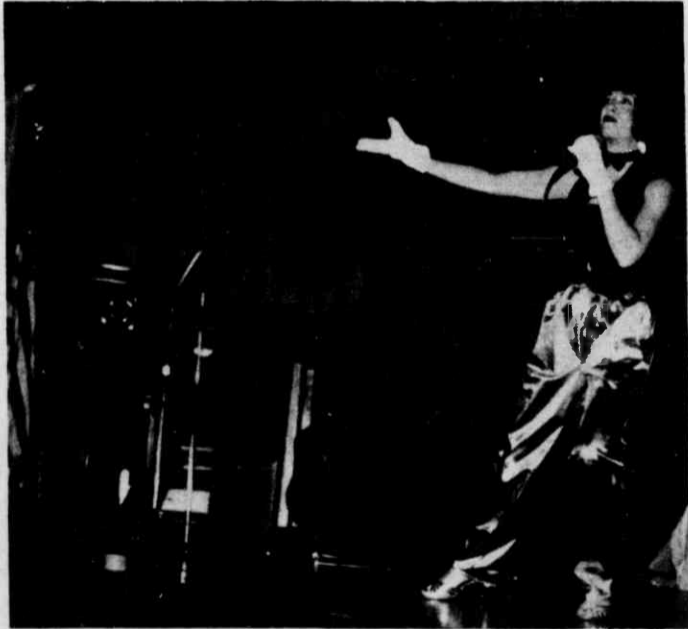
GALGALIM: Superb entertainers provided an evening of sheer enjoyment.