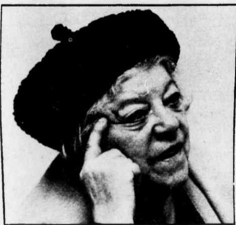
Joint Cultural Appeal

A cluster of nine organizations involved with promoting Jewish culture, Yiddish, art, theatre, etc.