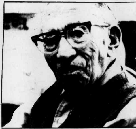
Charlotte Clergy Association

Promoting contact and programming for all Rabbis.