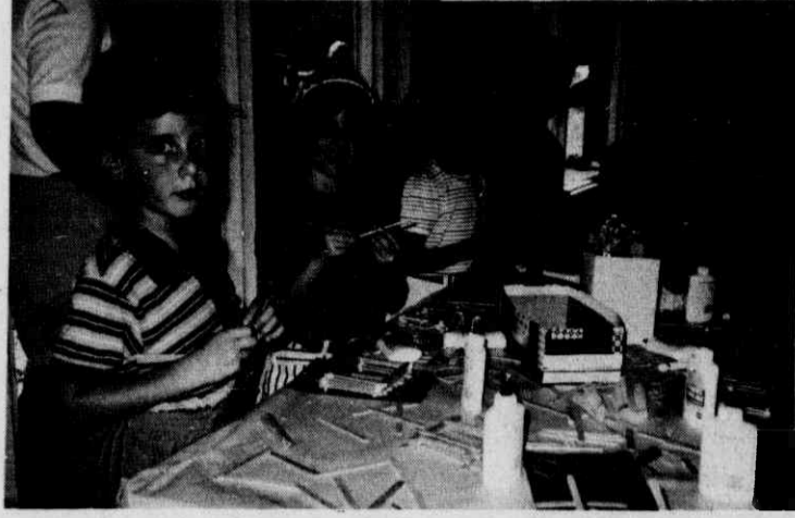
Preschool children being creative at the "New Academy."

The new Hebrew Academy is located on a beautiful 54-acre site on Providence Road in southeast Charlotte. One enters The Blumenthal Jewish Educational Building turns to the right and walks down the Hebrew Academy corridor. On the right hand side are the primary classrooms which will house the kindergarten through third grades. Each of these classrooms will open onto a lovely landscaped play area where children can enjoy outdoor activities. On the left side of the corridor are the Director's office and the 4th, 5th and 6th grade classrooms. In the youth activities room, the Academy will hold its worship services in a chapel area, and in another part of the room will set up for lunch and special events. Many new and exciting opportunities will be available to the Hebrew Academy students in our new home. The sweetest of sounds will be heard in the music room; study and lectures will be presented in the well stocked library; creations of all kinds will be made in the arts and crafts facilities. A complete physical education program will be provided in one of the first sports facilities in the area, including the use of Leon and Sandra Levine Jewish Community Center Building.