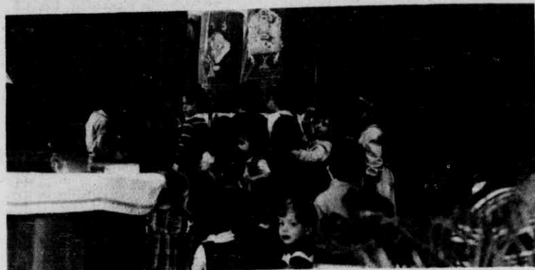
The Ark is opened to reveal the Torahs.