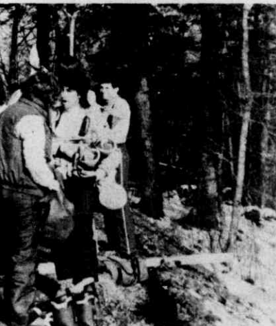
trek to the lodge.