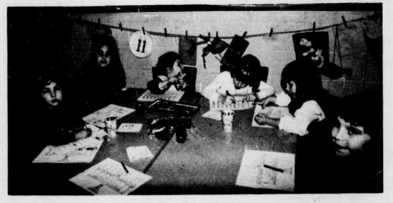
At the crafts table making menorahs.

The Nursery service has been such a success largely due to the fact that we have